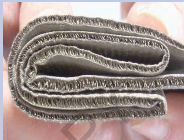
Figure 2. The 3D delivery system is designed to maintain an ideal moist, but not wet, healing environment.

are injured are cellular and nuclear membranes and deoxyribonucleic acid. 1